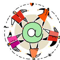
Voice-over-IP applications for amateur radio are finally maturing.

A handful of local ops consider 6m their personal domain and have been known to chase off or discourage newcomers. Report any intentional interference. Take back YOUR band!